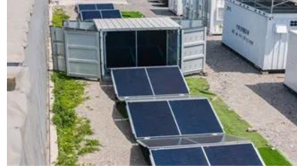
Banjul Lithium Battery Project , PABIANICE BESS

The energy storage system is essentially a straightforward plug-and-play system which consists of a lithium LiFePO4 battery pack, a lithium solar charge controller, and an inverter for the voltage