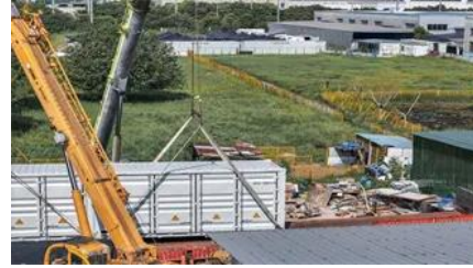
SolarContainer microgrid moves toward mass production

SolarContainer is a fully integrated, rapidly deployable microgrid that combines solar energy production with battery storage, along with advanced