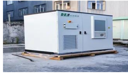
30kWh 288V LiFePO4 High Voltage Battery Rack for Solar

30kWh 288V LiFePO4 High Voltage Battery Rack for solar and commercial energy storage. Modular, safe, and reliable. Contact us for details.