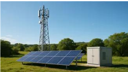
How artificial intelligence can help achieve a clean energy future

Kooltronic offers innovative cooling solutions for battery cabinets and electrical enclosures used in renewable energy storage systems. Click to learn more.