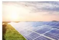
Energy Storage System