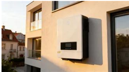
HJ-D48-G energy system is used for communication base station

This product is composed of low-voltage photovoltaic module, rectifier module, AC power distribution unit, DC power distribution unit, monitoring unit, lightning protection unit, etc., which can