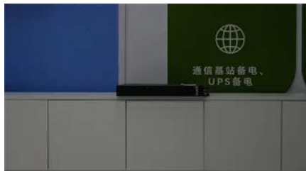
Cost of 100kW energy storage cabinet for middle eastern base stations

Wondering how much a Juba large-scale energy storage system costs? This comprehensive guide breaks down pricing factors, industry trends, and smart purchasing strategies for commercial users.