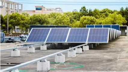
Kiribati RV low watt solar power generation , EQACC SOLAR

The findings of this roadmap show that power sector is a key area, where the ongoing efforts from the deployment of solar PV should be continued and complemented with and improvement of efficiency