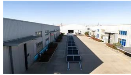
Sol-Up Solar , Premier Las Vegas Solar Provider

Photovoltaic (PV) technologies - more commonly known as solar panels - generate power using devices that absorb energy from sunlight and convert it into electrical energy through semiconducting