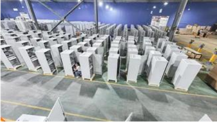
Solar container communication station inverter grid-connected project

While maximizing power transfer remains a top priority, utility grid stability is now widely acknowledged to benefit from several auxiliary services that grid-connected PV inverters may offer.