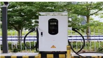
304 Stainless Steel Energy Cabinet ,Outdoor Waterproof Enclosure

Widely used in telecommunications, power distribution, solar energy, and traffic control sectors, this energy cabinet supports integration of various electrical devices with easy maintenance and upgrades.