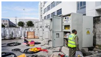
Deployment Of Communication Base Stations And Wind Solar

The wind-solar-diesel hybrid power supply system of the communication base station is composed of a wind turbine, a solar cell module, an integrated controller for hybrid energy.